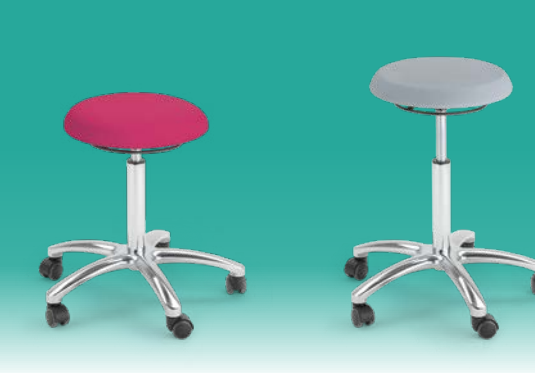
Universal stool HKL 1, foam seat part covered with imitation leather